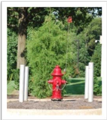
Iron and steel used in guard posts provides a strong barrier.

Iron and steel —Steel is used to make handrails and galvanized vehicle guard rails, guard posts, stairway guard rails, and boom gates that serve as vehicle barriers.