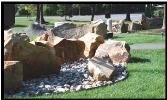
Stone can be used as a functional and aesthetic barrier.

Soda ash —Soda ash is used as the feedstock to make sodium bicarbonate (baking soda) used in fire extinguishers. In the event of a chemical spill from one of the laboratories, it could be used to neutralize acid spills or other chemical leakage.