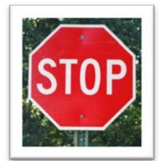
Zinc used in outdoor signs prevents corrosion and deterioration.

Zinc —Zinc is used in outdoor signage, indoor exit signs (if phosphorescent), and guard rails to prevent corrosion and deterioration. Tritium exit signs are coated with phosphor (ZnS) and filled with tritium ( ^3\text{H} ) gas. As the gas decays into helium, it produces low-energy beta particles, which strike the phosphor and cause it to luminesce.