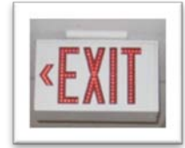
Strontium is used in photoluminescent exit signs.

Strontium —Photoluminescent exit signs use a class of newly developed phosphorescent pigments that are based on strontium oxide aluminate chemistry.