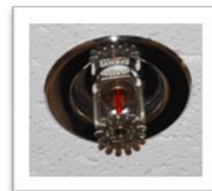
Sprinkler systems use bismuth, indium, and tin to trigger discharge of water to suppress fires.

Bismuth, indium, and tin —Bismuth, indium, and tin or their alloys are used in the plugs in sprinkler systems that are built into ceilings to extinguish fires. These metals have low melting points, and when they are alloyed with each other or with other low-melting-point metals (such as lead), their melting point drops even further. In the event of a fire, the “plug” melts rapidly and releases the fire-quenching liquid inside.