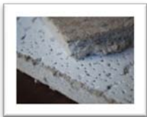
Perlite used in ceiling tiles dampens noise.

Nickel —Nickel is used in nickel-cadmium industrial batteries that provide power to emergency lighting fixtures and backup power to medical equipment and may be used in stainless steel handrails, doors, bus shelters, security barriers, and fences.