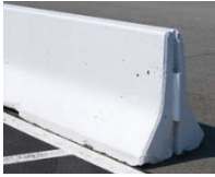
Cement and construction gravel are used in jersey barriers.

Cement and construction gravel —Cement and construction gravel are used in concrete in the jersey walls in the parking lots around the perimeter of buildings.