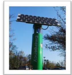
Copper wiring provides a reliable conduit to power emergency lighting systems.

Copper —Copper wiring provides power for emergency lighting systems and power and signal transmission for emergency alarms connected to fire and smoke detectors. Brass valves and electronic controls provide automatic shutoffs to fire sprinkler systems. Copper tubes deliver a safe, potable water supply.